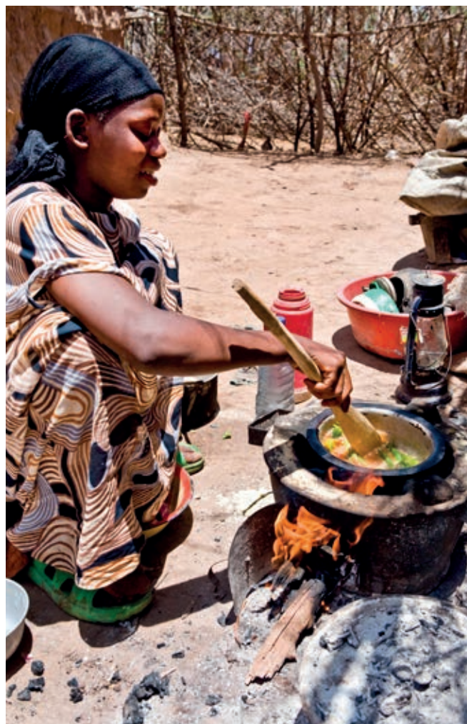
Sight and Life

In the short term, vitamin A supplementation is the most effective way to reduce vitamin A deficiency and child mortality (see page 70). Doing something about vitamin A deficiency on its own, however,