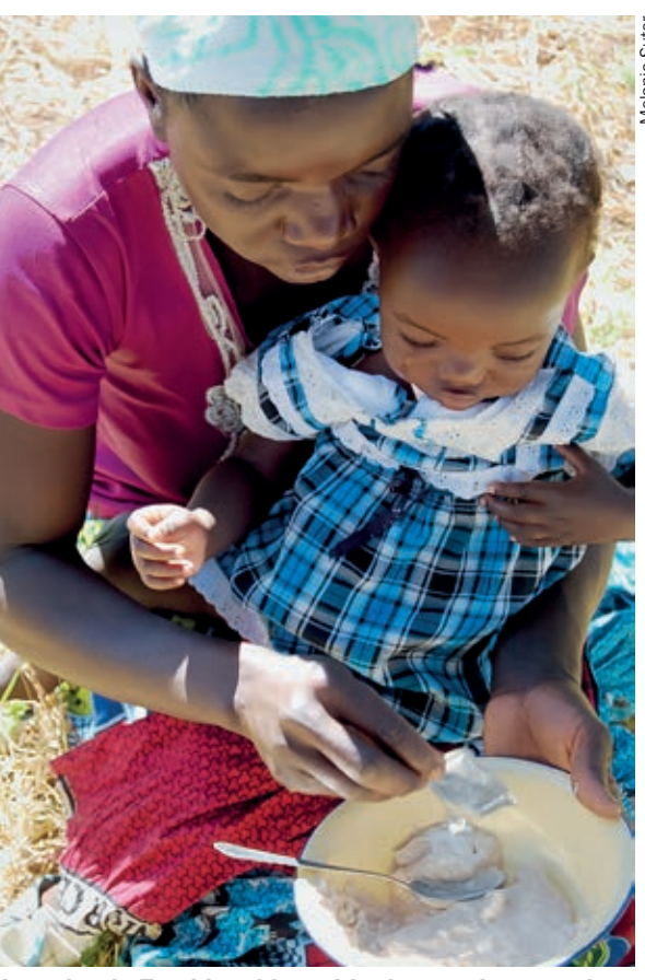
A mother in Zambia adds multi-micronutrient powder to her daughter's porridge

commercial infrastructure is adequate, fortification of food staples like flour, sugar, oil or condiments with pre-formed vitamin A (retinol) can be a very costeffective way of reducing VAD. To be successful, the fortified food must be eaten by those at risk of VAD (young children and mothers) on a regular basis. To increase acceptability, the appearance, shelf-life and costs of the fortified and non-fortified food should be comparable. Fortification programmes demonstrate that with high coverage and adequate fortificant levels, food fortification can improve vitamin A status, and thus have a positive health impact.