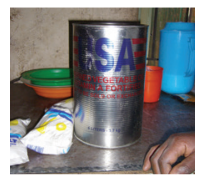
Can containing fortified vegetable oil

Sources: http://www.economist.com/node/21550328, http://www.guardian. co.uk/lifeandstyle/2011/jul/17/bread-food-arab-spring